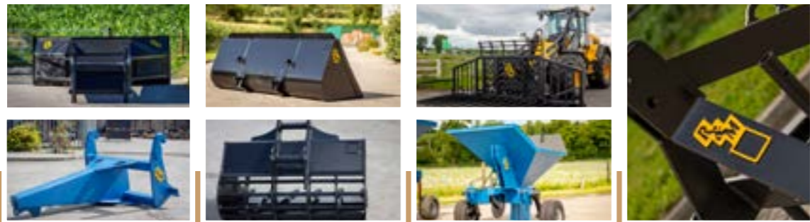
04 | Buckets and Attachments - 08 | Agri Loader 12 | Drainage Solutions